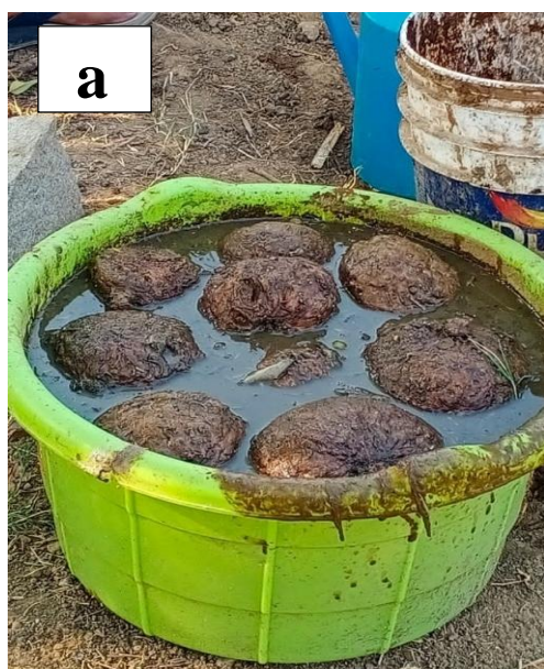
Fig. 1a. Corm treatment of elephant foot yam