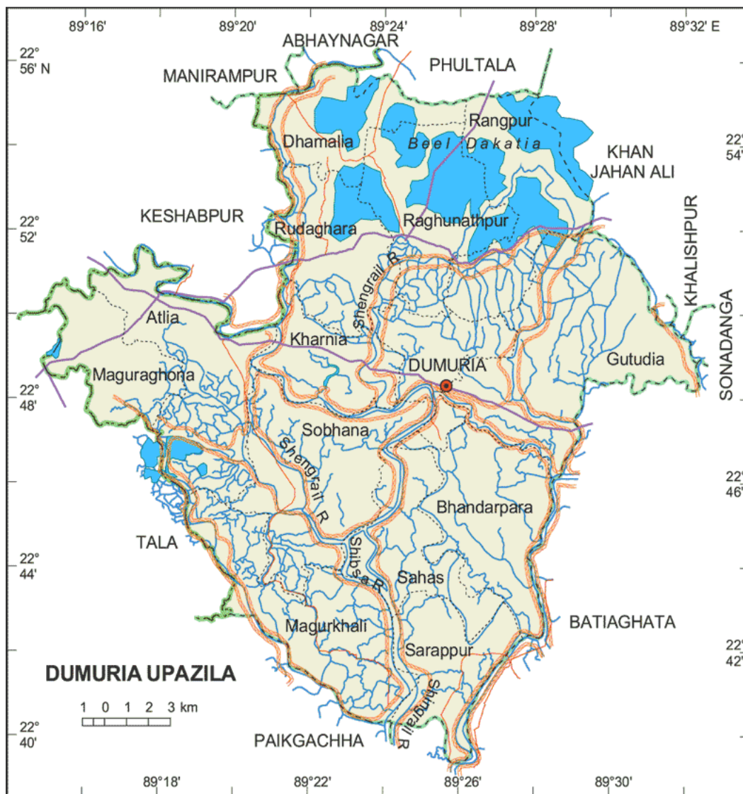
Map 1. Geo Map of Dumuria Upazila of Bangladesh (Study area)

indicated that intergenerational changes occurred regarding literacy rate, family size, kinship trend, social power and status of stakeholders. Accordingly, the specific objectives of this study were to document the socioeconomic profile, to identify the sources of household income and income generating activities and to assess the major effects of natural hazards (Aila and flood) on household income and employment of family members and coping strategies adapted by the selected disadvantaged smallholders living in Polder No. 29 and LGED-managed sub-polder (Latabunia) in Khulna district of Bangladesh.